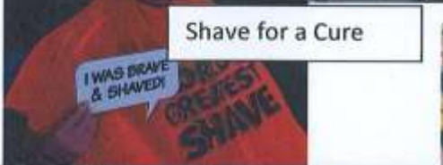
Shave for a Cure