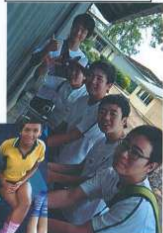
Japanese Agricultural Visit