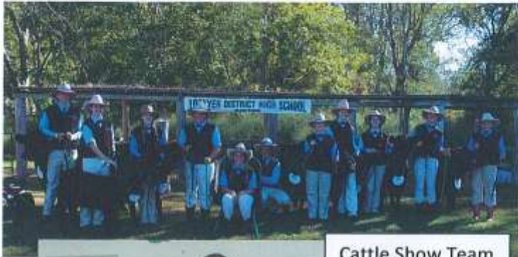
Cattle Show Team