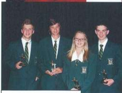
Mayoral Speech Contest